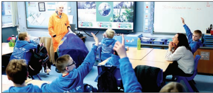
W5 Learning & Education Team, Mash Direct, Comms & Events Executive and Pupils from Kilcooley Primary School