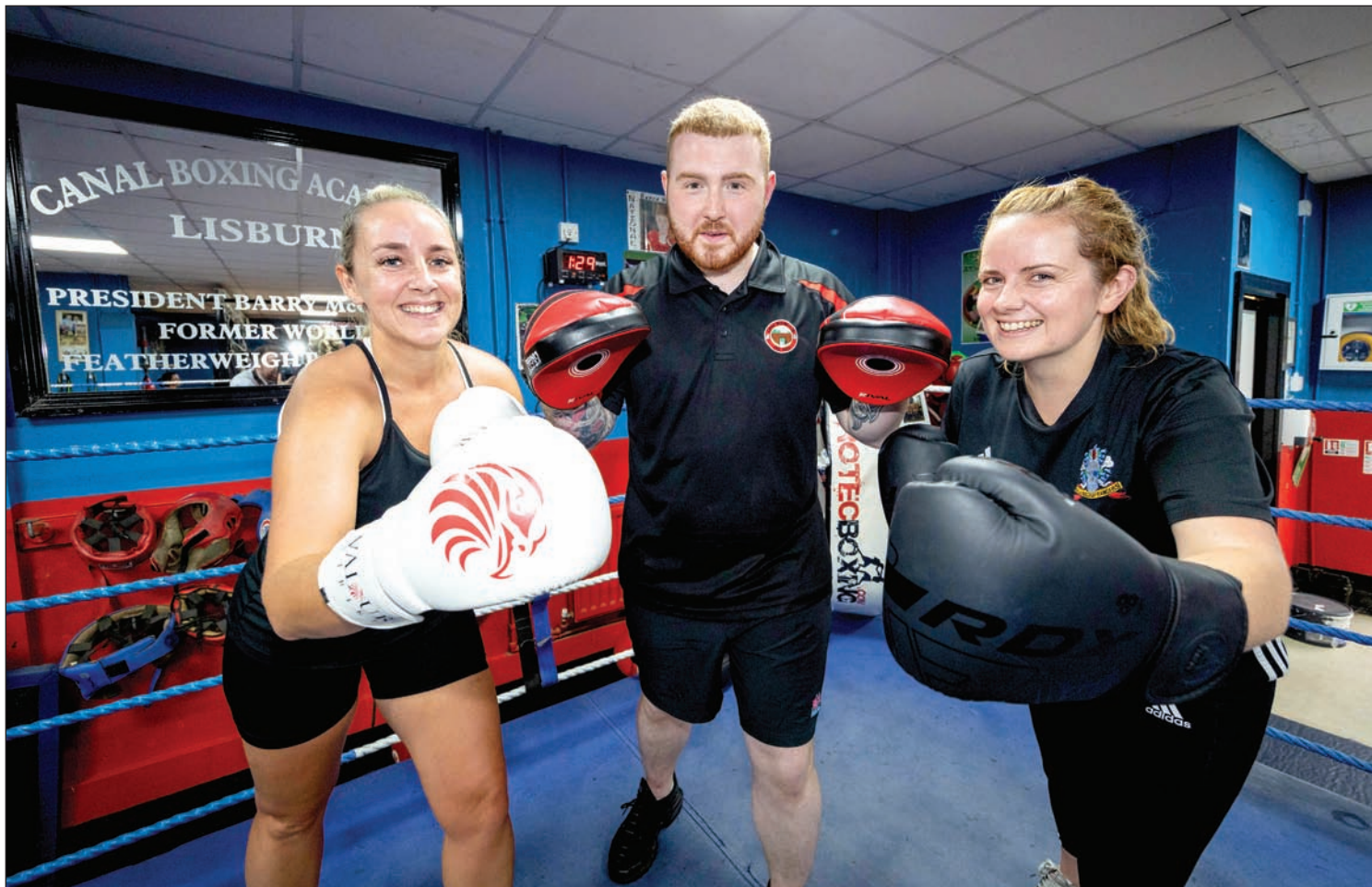
Stronger Together was delivered in partnership with Ballymacash Sports Academy and Canal Boxing Academy.

GARDEN FURNITURE SALE | 1/2 PRICE FASHION & SHOE SALE | HEALTH STORE, BOUTIQUE, HARDWARE, COFFEE SHOP, INTERIORS