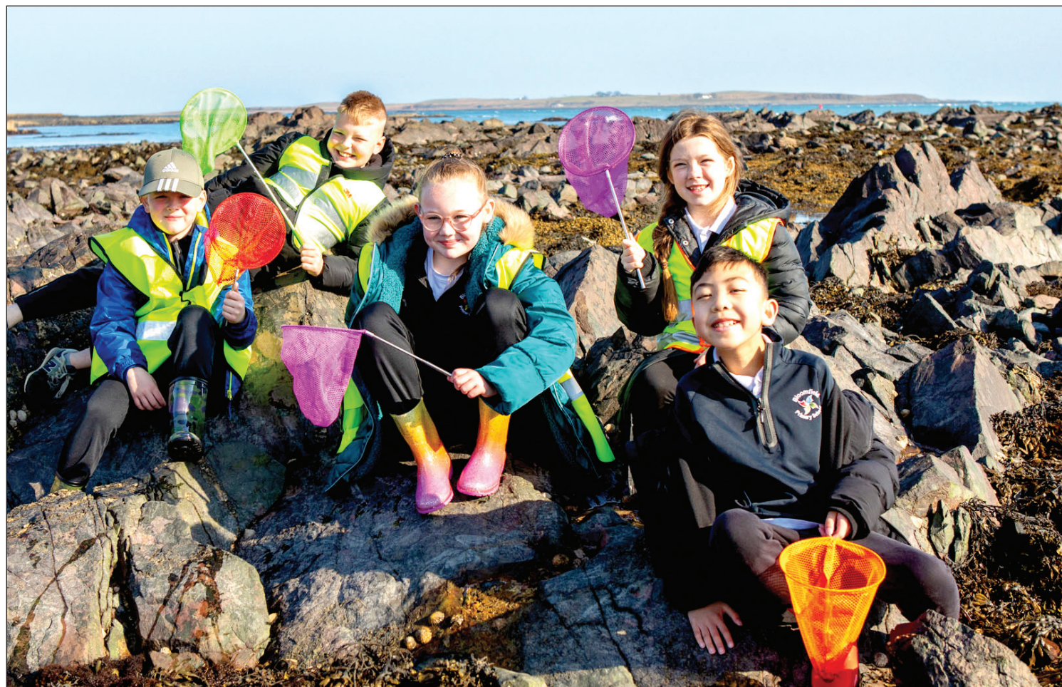
Students from Bloomfield Primary School took part in Project ELLA in Donaghadee.