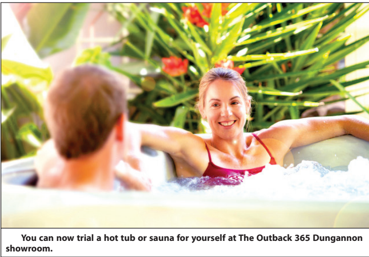
You can now trial a hot tub or sauna for yourself at The Outback 365 Dungannon showroom.

concentrating resources and expertise in one central location, Outback 365 can offer a more personalised and comprehensive shopping experience. The Dungannon showroom now boasts an indoor space for year-round comfort, wet changing facilities for trying out hot tubs and saunas, and even an in-house coffee bar for a relaxed browsing atmosphere. This dedicated space allows customers to fully immerse themselves in the product range and receive focused attention from the knowledgeable team. Streamlined Operations and Services: Consolidating into a single hub allows Outback 365 to streamline its operational processes. This can lead to greater efficiency in inventory management, service scheduling, and overall customer support. Customers can expect a more cohesive and