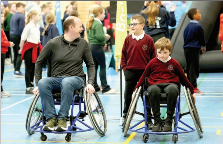
Wheelchair basketball was one of the sports on offer at the Celebration of Sport event in Carrickfergus recently.

Now in its 11th year, the Celebration of Sport is a fantastic opportunity for young people to try out different sports and help them become 'more active, more often'. For the second