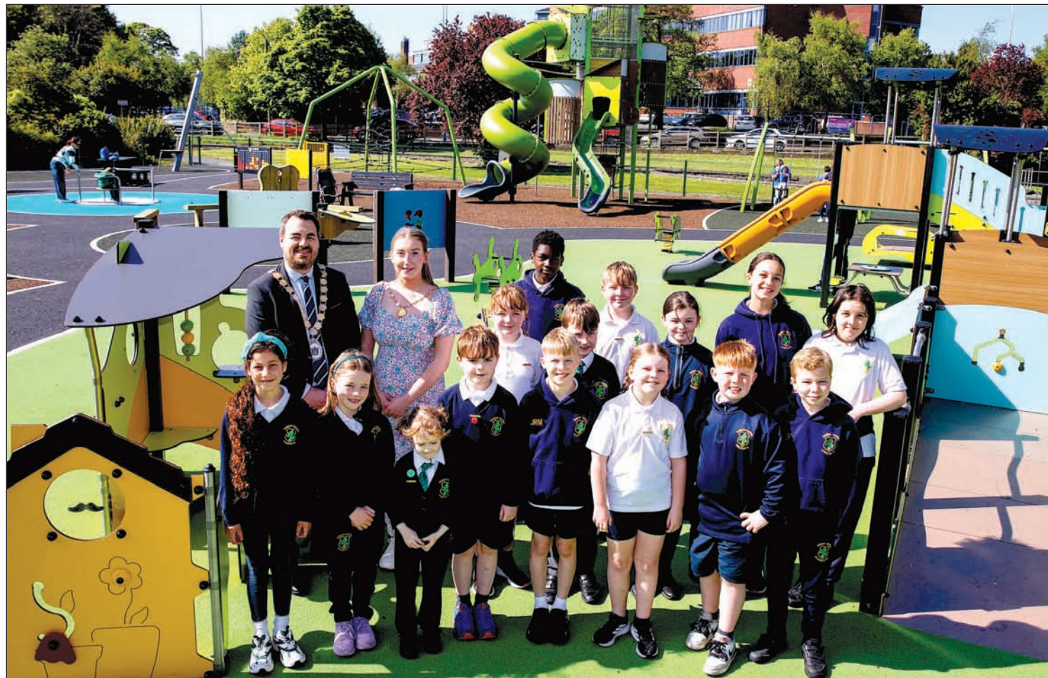
Mayor and Mayoress visit Ward Park Play Park with pupils from Bangor Central PS