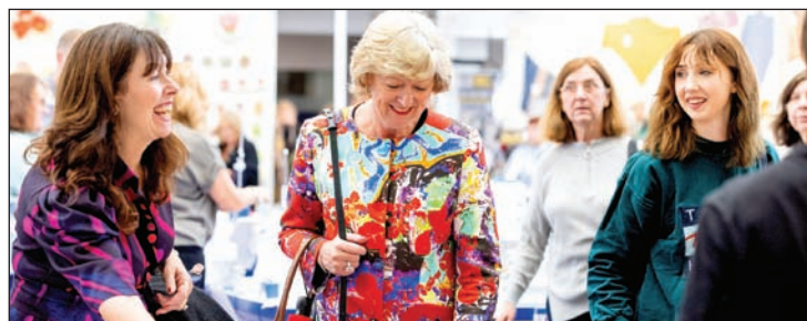
market leading consumer textiles exhibition in the UK. The Knitting & Stitching Show in Belfast will be the 5th event

cross stitch, embroidery, knitting & crochet, dressmaking, sewing, patchwork & quilting and everything in between! The K&S event launched in London in 1991, closely followed by launches in Harrogate and Dublin in the mid 90s. Over a 30-year period, The Knitting & Stitching Shows have grown to become the