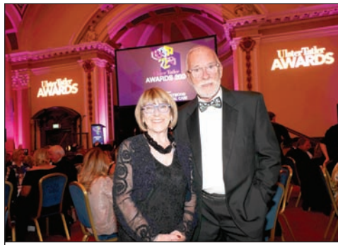
Lifetime Achievement winner Ian McElhinney & wife Marie Jones

The rest, as they say, is history and Ian has since gone on to achieve remarkable success, winning numerous awards and accolades along the way, last night's being the most